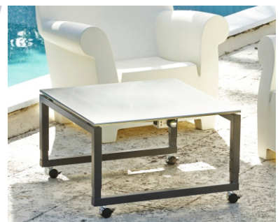
Shown accessories not included.