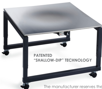
The manufacturer reserves the right to update, change, alter or discontinue any model without notice.