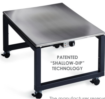
The manufacturer reserves the right to update, change, alter or discontinue any model without notice.