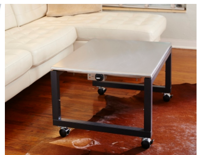
Shown accessories not included.